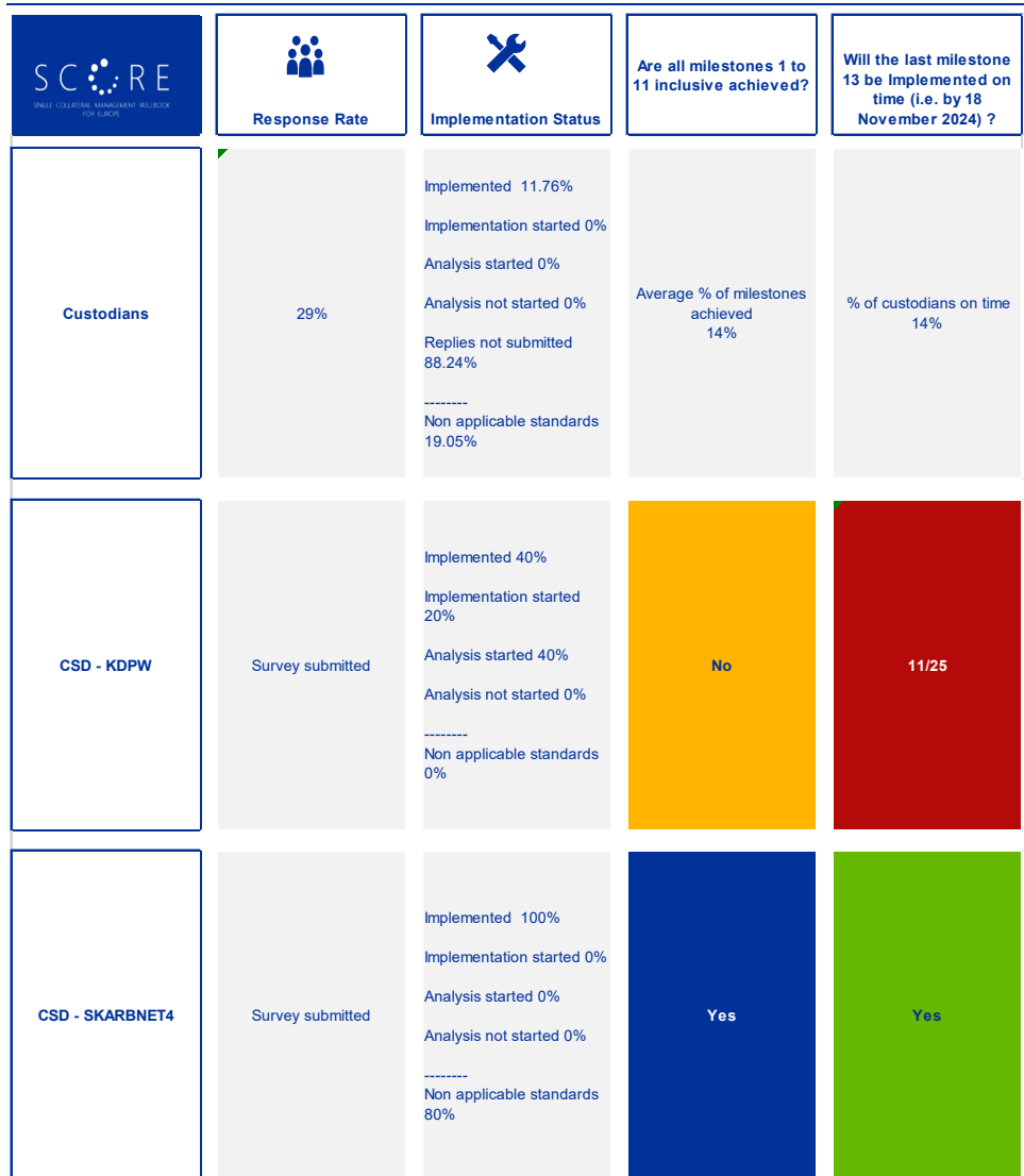
Figure 1 Summary of the monitoring exercise