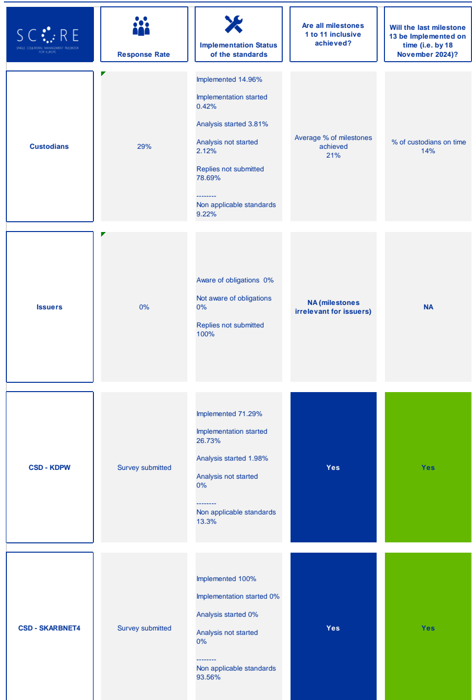
Figure 1 Summary of the monitoring exercise