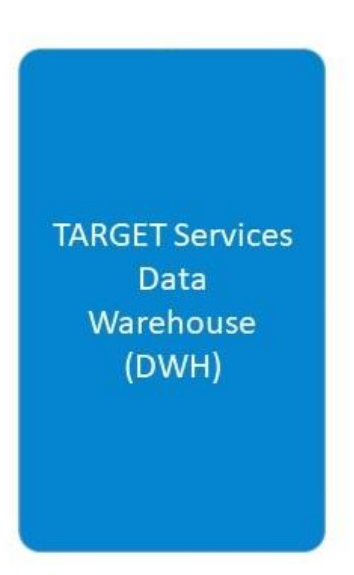
Figure 1 - High level DWH coverage

Each component of the T2 Service and T2S has its dedicated production database. The DWH consolidates the content of those production databases into a single database for operational and statistical purposes for the operator, CBs, ancillary systems and payment banks. It is ensured that the provision of data from production databases to the DWH does not influence the functioning and availability of the T2/T2S Services and the respective underlying production databases.